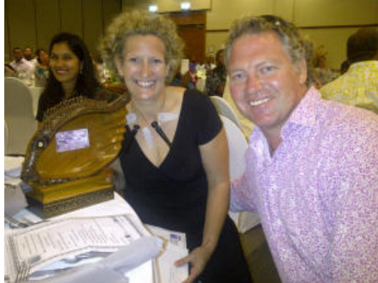
Hot Glass Fiji wins a 2014 FDB SME AWARD

Hot Glass Fiji won the Jury Prize – Special Award in the 2014 Fiji Development Bank Small & Medium Enterprises Awards .